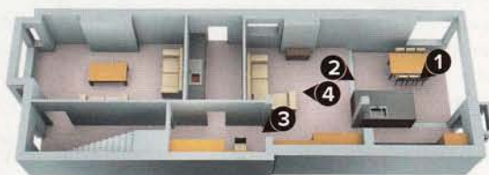
◀ GROUND FLOOR The main living room is at the front of the house. At the back, there’s a large open-plan kitchen/living space and separate utility room