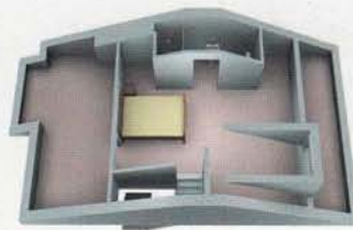
◀ TOP FLOOR A spare bedroom with en suite and plenty of fitted storage is in the loft

“It’s really hard work living on a building site, but it does