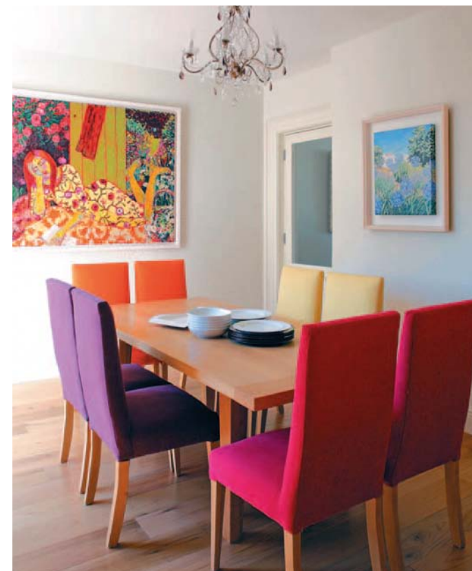
Upholster dining chairs or have loose covers made up to cover existing chairs – co-ordinate with an art work for a truly co-ordinated look.